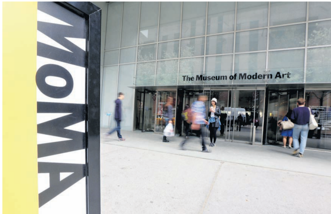
People walk by the entrance to the Museum of Modern Art, in New York, April 22, 2014.